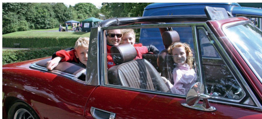
Classic Car raffle winners about to take a ride in the Triumph Stag

For further information pick up a handbill or telephone 01246 414847.